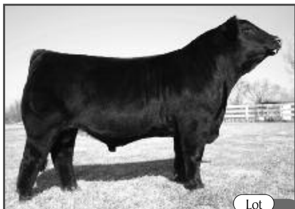
KYLD Daytona 730T - Sire of Lot 30