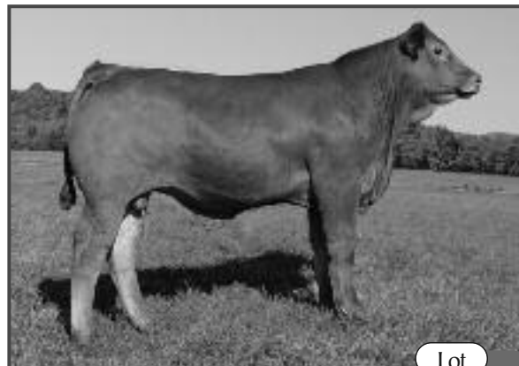
EAFF Polled Pugilist 633R - Sire of Lot 29

The resulting calves from this embryo mating will be exceptional polled fullblood genetics. The dam is the great Laura's Accent that has been such a pillar in the fullblood gene pool.