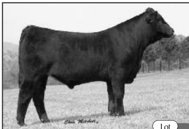
DVFC Main Event 109R - Sire of Lot 17

Open SVL Temptress 23U is by the popular son of EF Main Stay 541M, DVFC Main Event 109R. She traces back to a full sister to the immortal Cane Ridge Tempress.