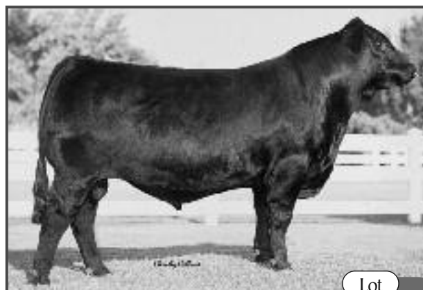
EXLR New Generation 071M - Sire of Lot 21

Open HBFL Roxy 20W is one of the good consignments from Hickory Bend Farm.