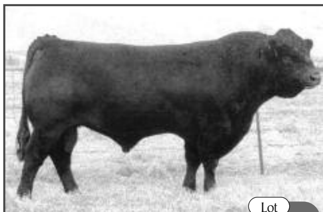
JCL Lodestar 27L - Sire of Lot 16

SVL Scarlet 168U combines some of the best Limousin blood in the industry. She traces to the great donor family line of OTSS Lindy's Scarlet 5018T.