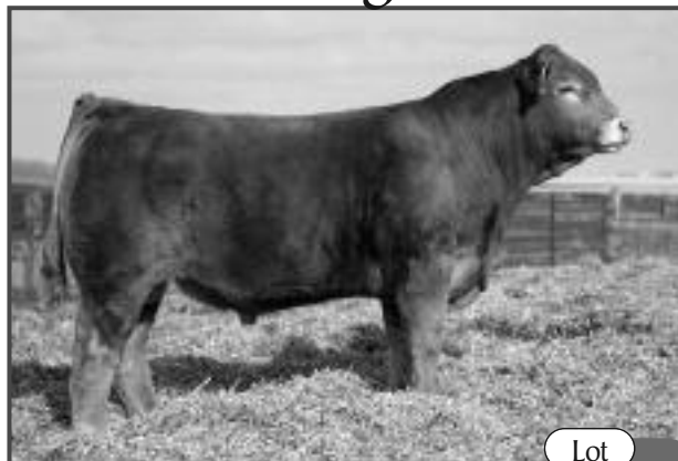
Wulfs Urban Cowboy - Sire of Lot 26

EXLR Luvly 821M is one of the most accomplished females in the breed. She is the dam of MAGS The General and MAGS Ultrathin, the top selling female in the 2010 Magness Family Tradition Sale.