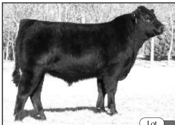
Wulfs Shop Talk 2332S - Sire of Lot 28

These embryos represent a combination of the best from the great EAFF Amphora 422M and Wulfs Shop Talk. The guaranteed polled and black calves will have impressive numbers and desirable phenotypes.