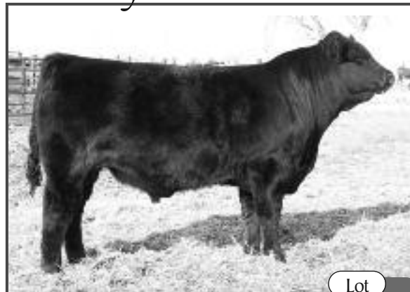
Wulfs Titus 2149T - Sire of Lot 27

These Embryos represent some of the best combinations of genetics in the industry. The dam was a successful show heifer campaigned by the Blaydes family.